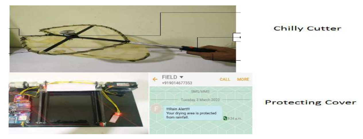
AVITHA -- Chilly Cutter and Protecting Cover

The Cover automatically covers the Crop and Soon after covering, the farmer will get a message as "!!!Rain Alert!!Harvesting land is covered". If there is no rain fall also if require the farmer can cover the crop voluntarily to protect it from other animals and from other problems. After some time he/she can uncover the cover by pressing the button of uncover. So this protector can also be used to cover other crops as well as other things whenever we want it to protect from rain or animals. The chilly cutter developed to cut either red or green chillies from plants consist of Cutting Blade, Motor and Switches. As per the instructions the blade works and cut the chillies from plants. . While cutting we can partition the bag 1 for red chillies and another for green chillies.