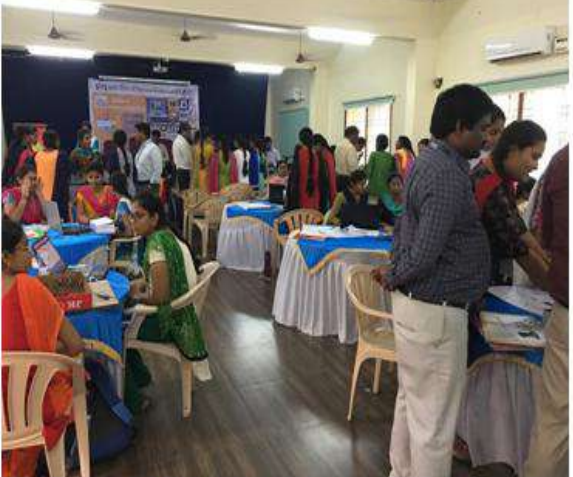
Work Shop on Entrepreneurship